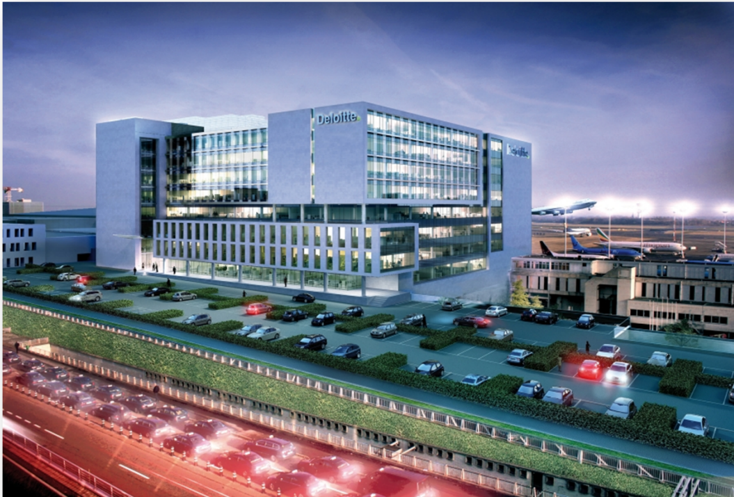
Gateway Building: Deloitte Belgium & Europe